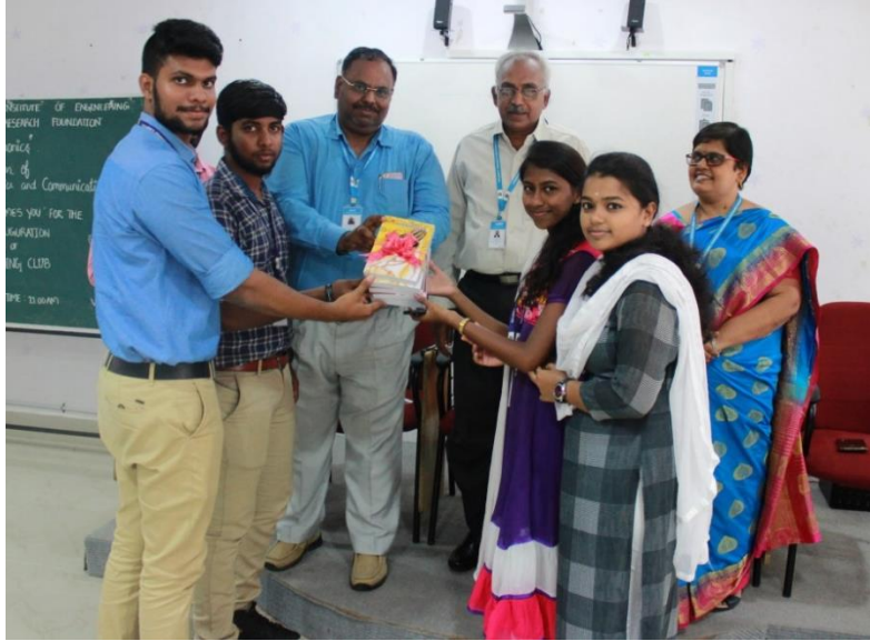
III year VI semester ECE (2016-2020 Batch) students donating the books to reading club