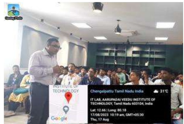
Resource person for delivering the speech to the students