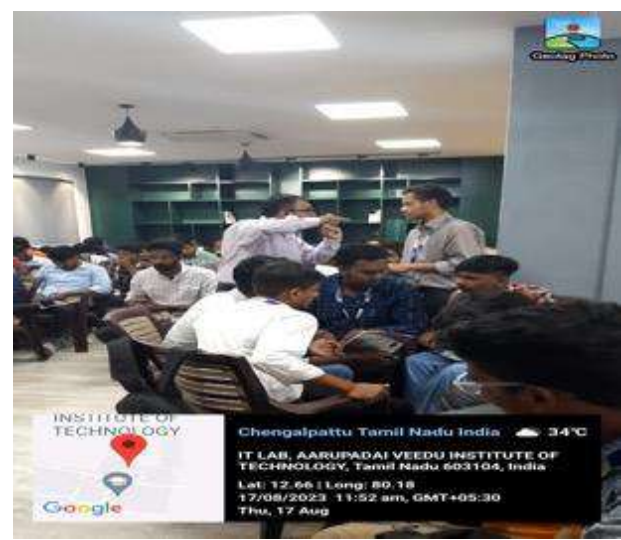
Resource person discussing with students