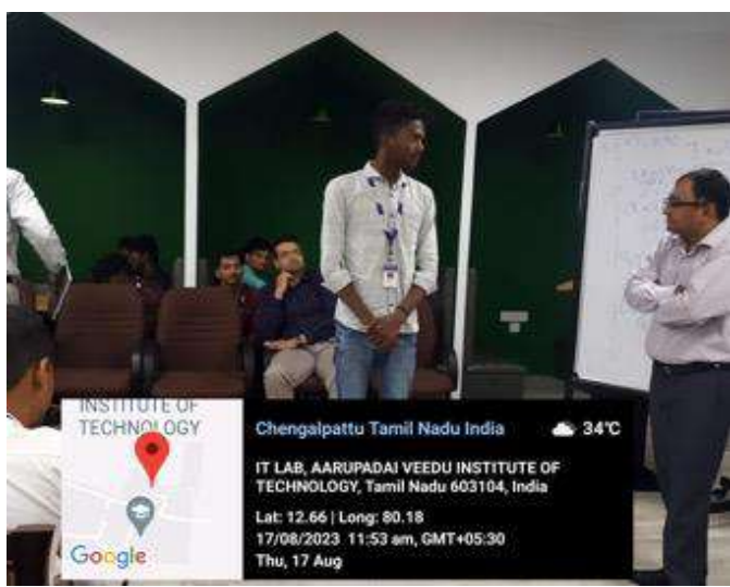
Student expressing his idea in session