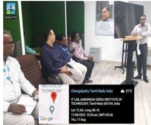
Resource person interaction with faculty members