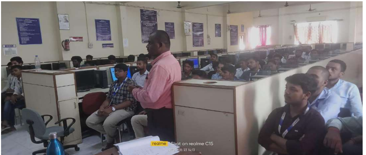
realme Shot on realme C15 2023/08/23 14:13