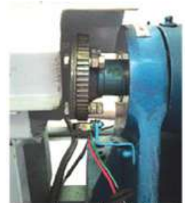
Common Rail Direct Injection (CRDi) Engine