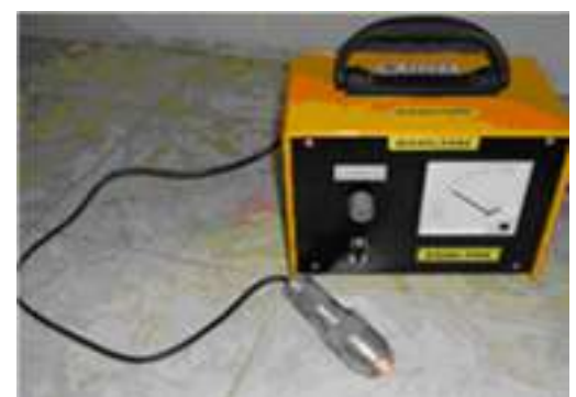
ENGINE PERFORMANCE AND EMISSION ANALYSIS TEST SETUP