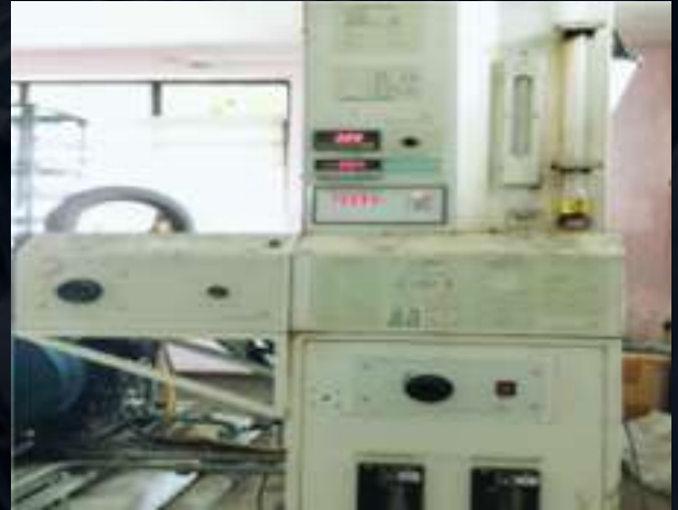
VCR ENGINE WITH EDDY CURRENT DYNAMOMETER